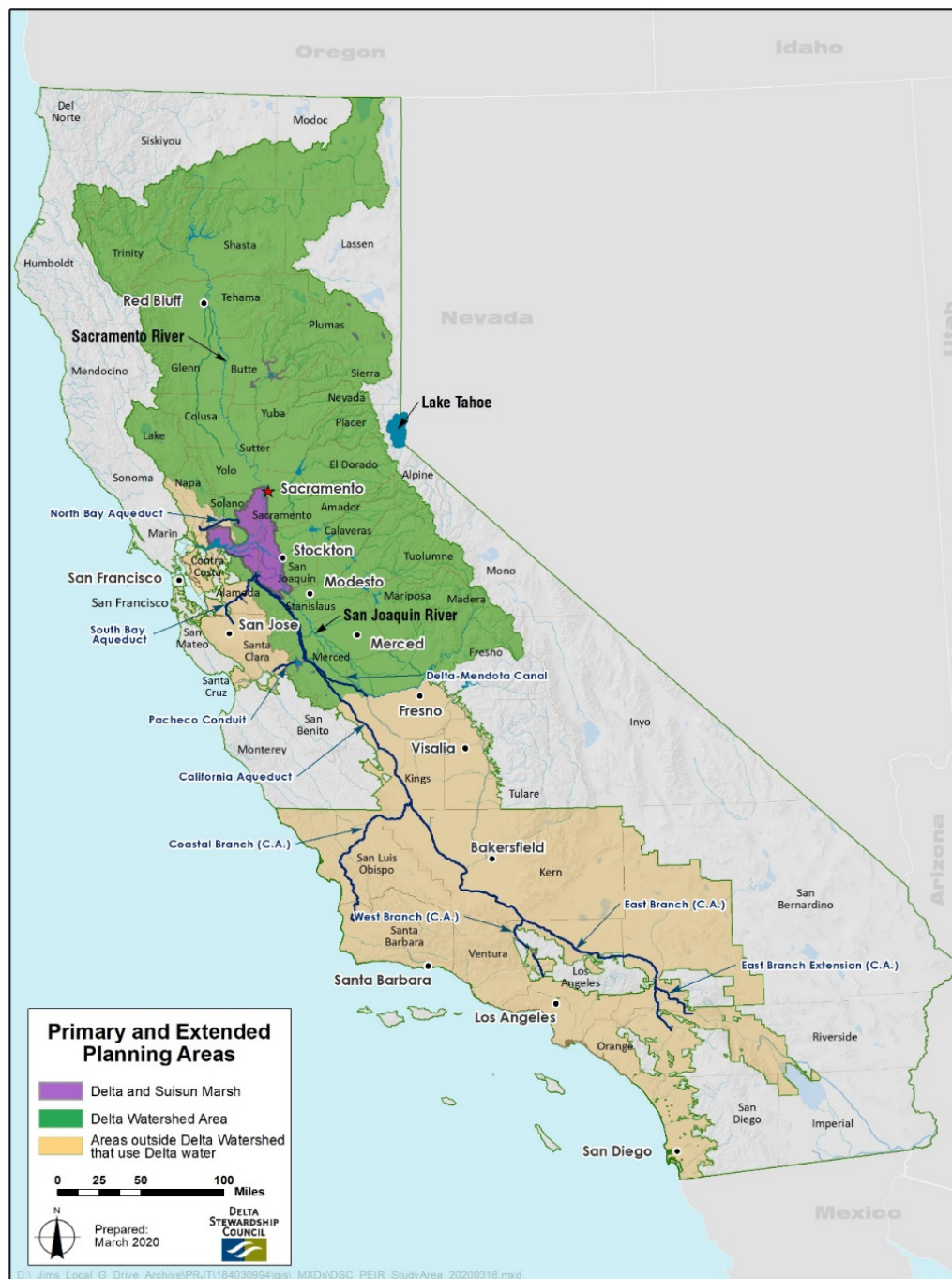
Figure 1. Planning Area for Delta Plan Ecosystem Amendment Program Environmental Impact Report

Figure 1 is a statewide map of California. The map identifies the Planning Area for Delta Plan Ecosystem Amendment Program Environmental Impact Report. The primary planning area is the Sacramento-San Joaquin Delta (Delta) and Suisun Marsh. The extended planning area is defined by the watersheds that contribute flows to the Delta (Delta Watershed Area) and areas outside the Delta watershed that receive water from or conveyed through the Delta.