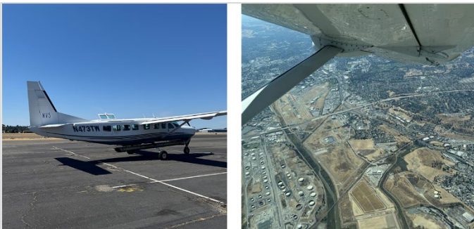
Blog: Partnership Takes Delta Science to New Heights