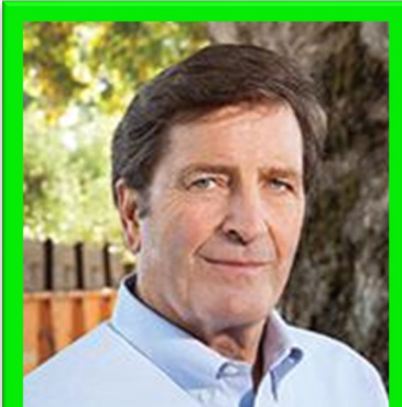
Rep. John Garamendi (D-08)