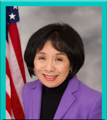
Rep. Doris Matsui (D-07)