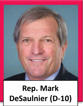
Rep. Mark DeSaulnier (D-10)