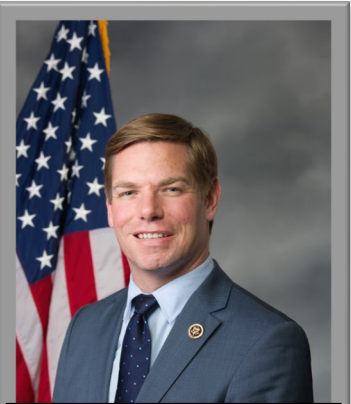
Rep. Eric Swalwell (D-14)