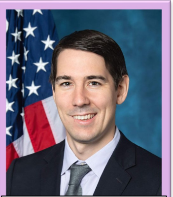
Rep. Josh Harder (D-09)