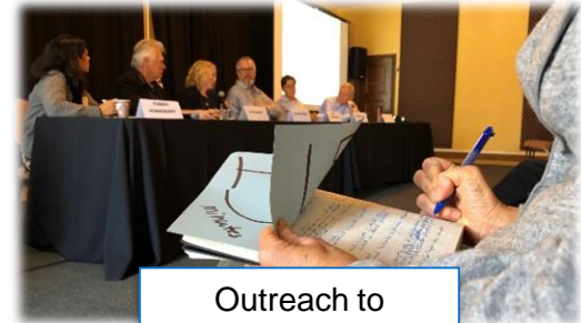
Outreach to External Groups