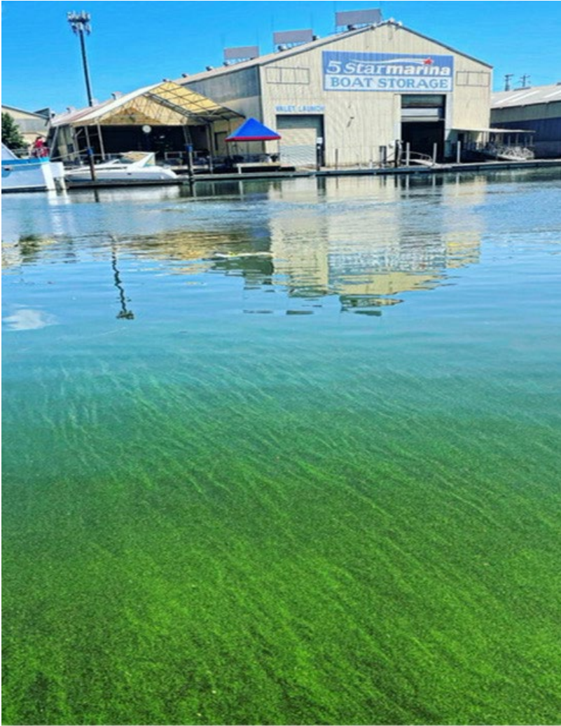
A harmful algal bloom at the Morelli Boat Ramp in Stockton, CA.