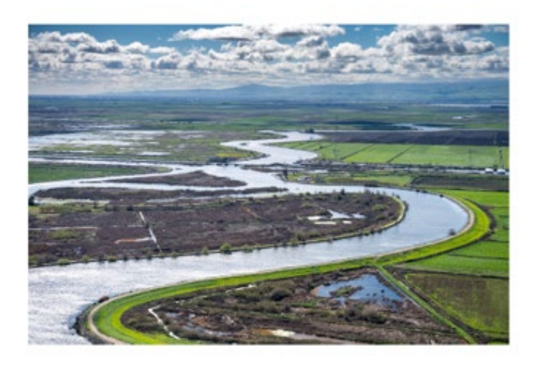
Five-Year Review of the Delta Plan October 2019