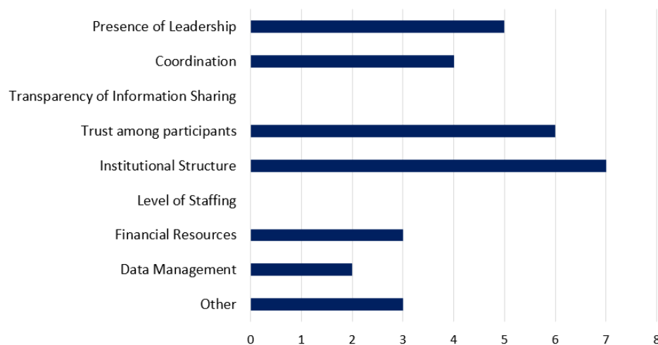
Figure 3. Participants chose what they believed was the biggest challenge for science governance in the Delta science enterprise. N = 30.

What is the biggest current challenge for science governance in the Delta science enterprise?