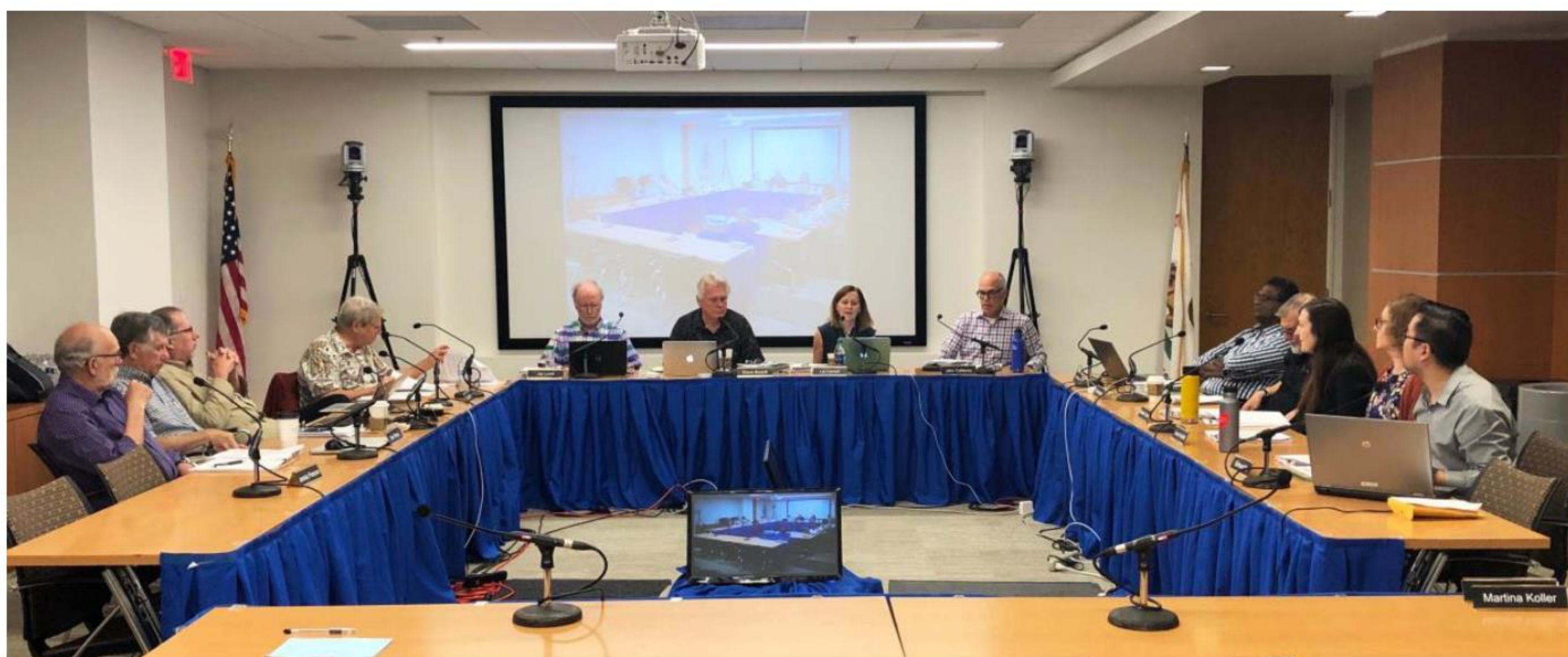
The Delta ISB provides oversight of the scientific research, monitoring, and assessment programs that support adaptive management of the Delta through periodic reviews