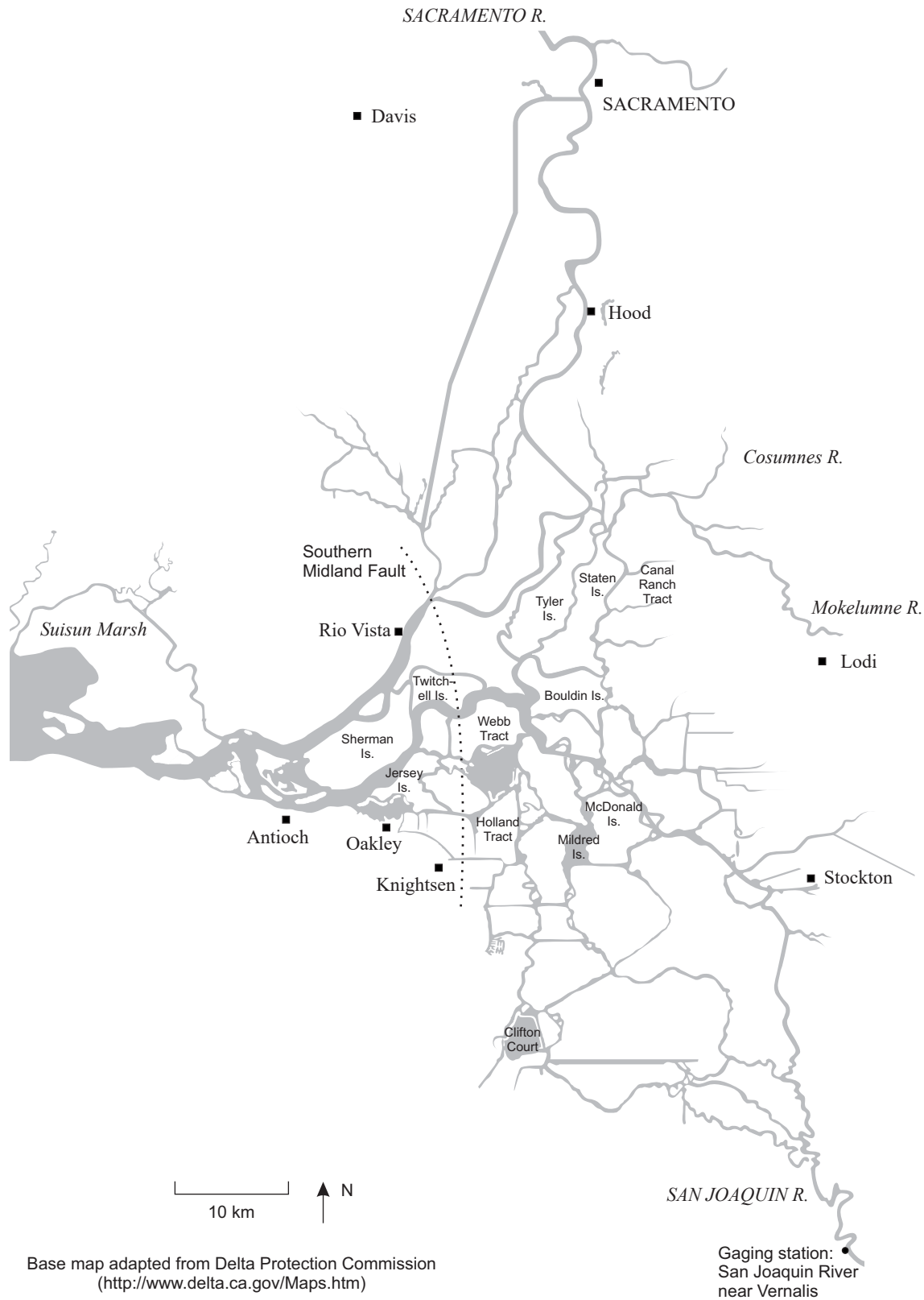
Figure 1. Index map including Delta place names used in the body of this report.