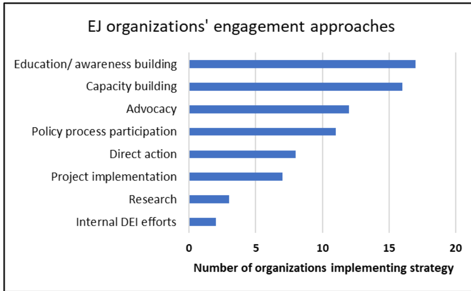
Figure 2: Frequently employed strategies EJ organization interviewees use to engage on EJ issues.

EJ organizations also spend significant amounts of time participating in public policy processes and advocating on behalf of EJ communities. Interviewees mentioned engaging with 29 different agencies across all levels of government: 4 federal agencies, 13 California state agencies, 12 local government agencies and districts, as well as interfacing directly with elected members in the State Assembly and Senate (See Table 4). Interviewees provided varying levels of detail on which specific policy processes or programs they engage with and what their experiences were like with these agencies, which are summarized in Table 4.